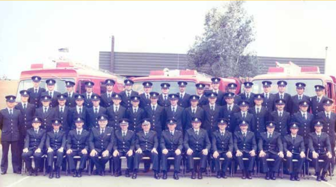
The College of 50, 2 September 1976