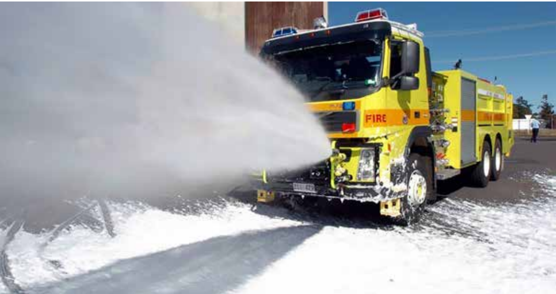
Compressed Air Foam System (CAFS) Tankers

The units are staffed by a Station Officer and three Firefighters and are located on the south of the ACT at Chisholm Fire Station and in the north at Gungahlin Fire Station.