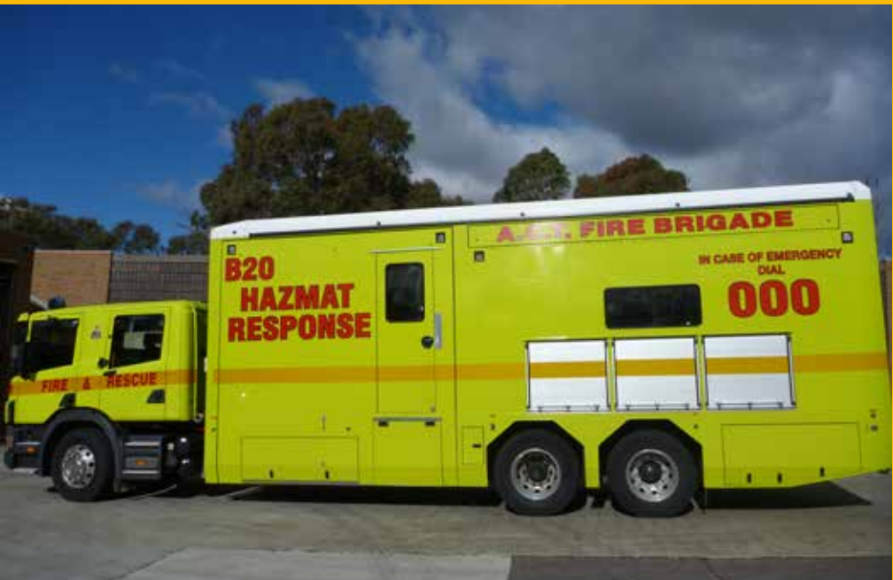
HAZMAT Support Vehicle