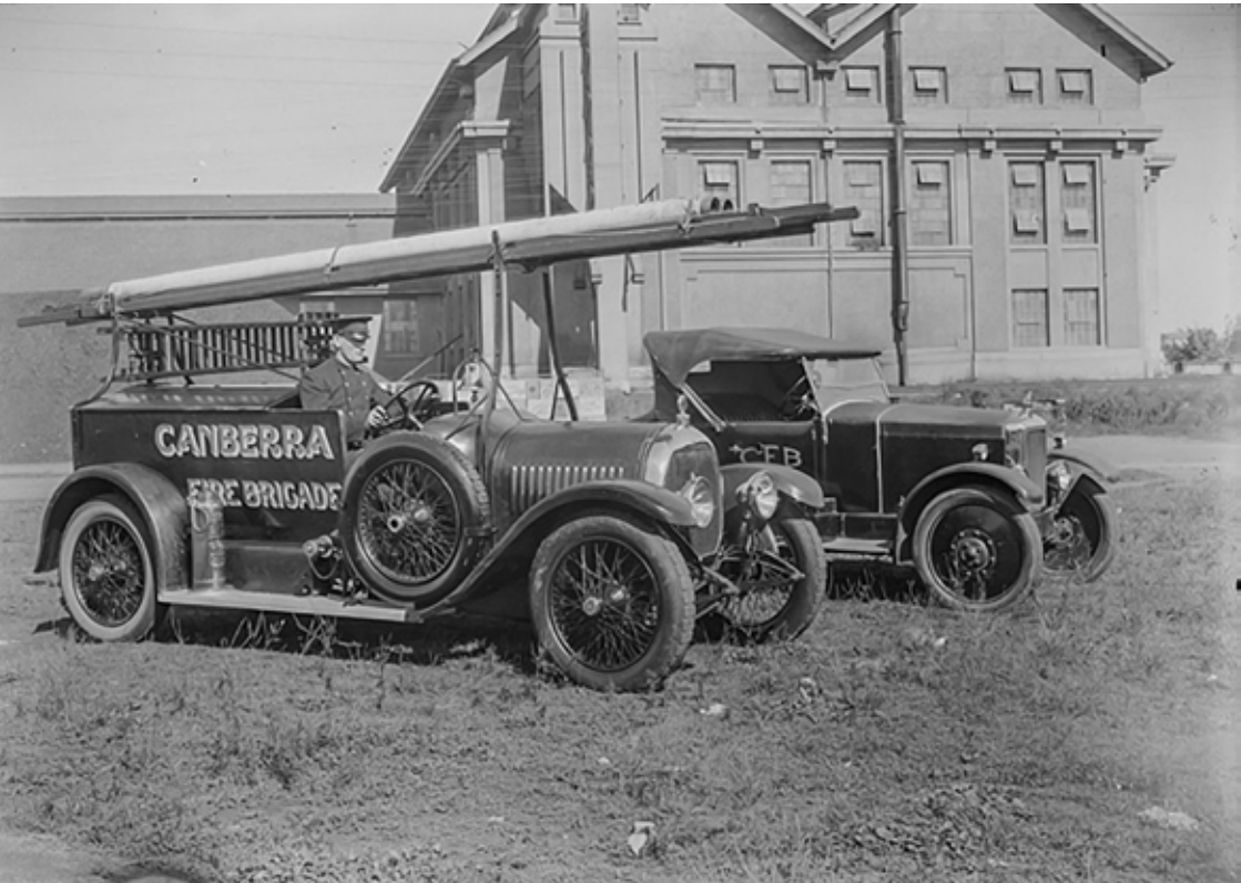
1924 Hotchkiss & Chiefs Car circa. 1928

In 1924 the Brigade received its first motor powered fire engine which was a converted Hotchkiss chassis and it operated throughout the 1930's as a combined fire engine and ambulance. In the period 1925 to 1932, five permanent officers were appointed and a further two appliances were purchased.