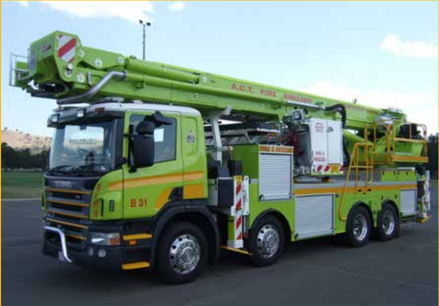
BRONTO Aerial Appliance (44 RLX)