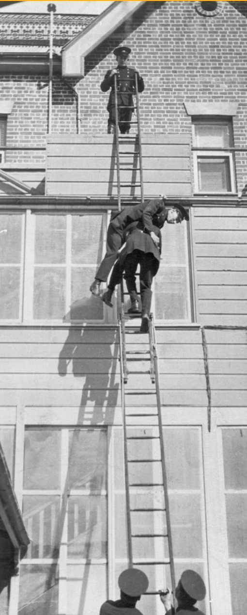
Canberra Fire Brigade Training at the rear of Yarralumla (now Government House) c1920s