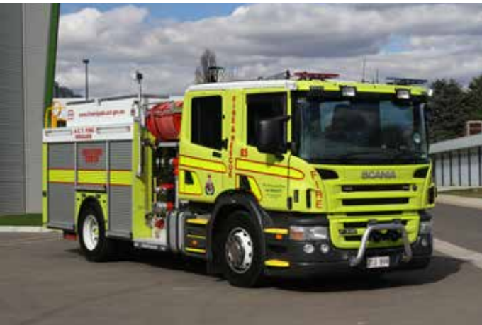
Varley Type 4 mid ship pumper and heavy rescue pumper

The Varley Type 4 pumpers include many functions the primary ones being rescue and fire suppressions capabilities. Other capabilities consist of foam making and pumping, Breathing Apparatus (BA), ladder rescue, Hazmat, medical emergencies, the ability to store personnel protective equipment and equipment to perform many other rescue functions.