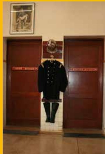
Chief Officer and Station Officer Rooms, Forrest Fire Station