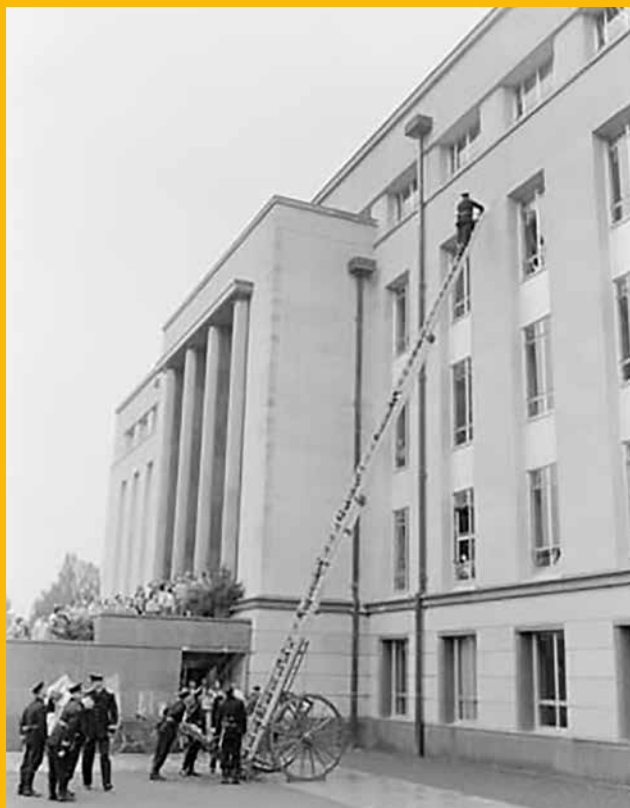
F12 motor Display at Treasury Building 23 April 1957