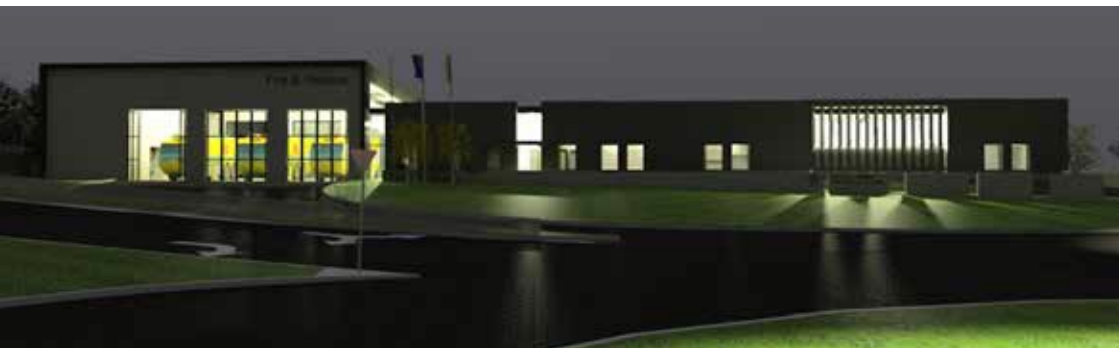
Artist impression of South Tuggeranong Station

Subject to ACT Government budgetary and statutory approvals, the ESA plans to deliver emergency service improvements to the ACT in four phases.