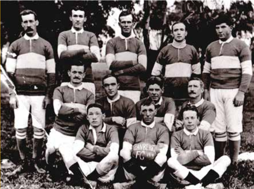
1914 Canberra Fire Brigade football team

His sporting activities included the ACT Cricket Association, Canberra Swimming Club, the Kingston Tennis Club, Canberra Rugby League, Acton race course establishment, Ainslie Tennis Club and Ainslie Cricket Club, Canberra Amateur Boxing and he regularly led gymnastics classes for all ages.