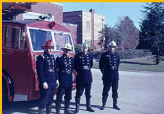
Changeover of Brass helmet to Plastic Forrest Fire Station circa 1968