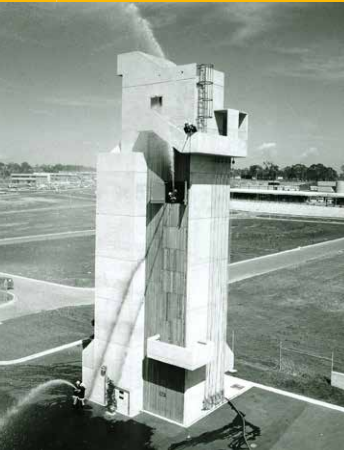
Training Tower Belconnen